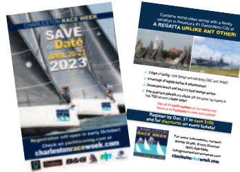
Post cards (shown above) are displayed at the US Sailboat show in Annapolis, the World Yacht Racing Forum and at yacht clubs and other events across the country.

Eligible sponsor logos will be featured on all email and direct mail correspondence to an extensive participant and opt-in database. Mailings will include, but not limited to: exclusive sponsor product offers via email, notice of race, confirmation kits, schedule of events, updates and post-event news. Sponsors will also have the option to provide an 8.5" x 11" promotional flyer to be inserted into confirmational kit mailers.