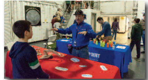
Space Day on the USS Yorktown